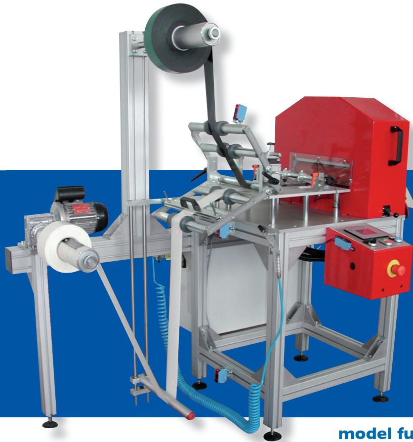
model full options